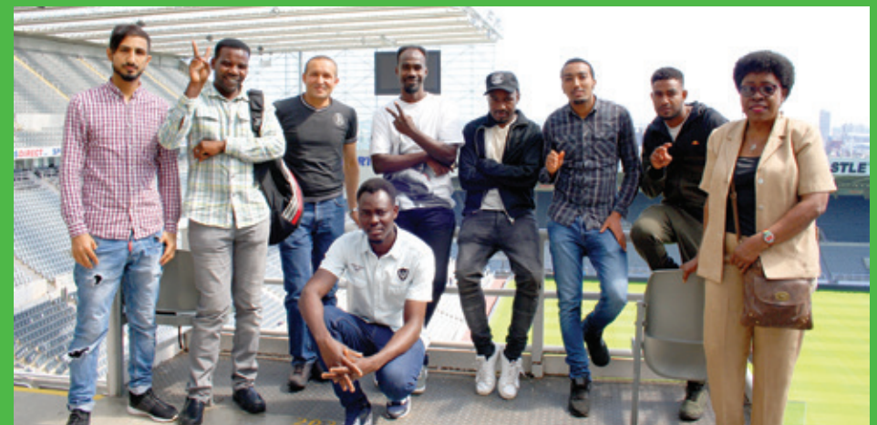
Residents on a trip to St James Park ▼