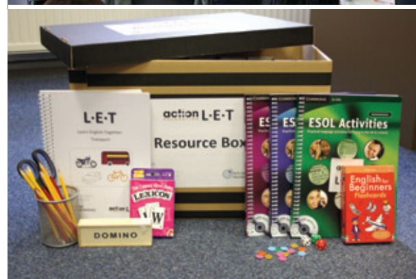
▲ Working together for North East ESOL. Conference organised by Action Language in partnership with NEMP.