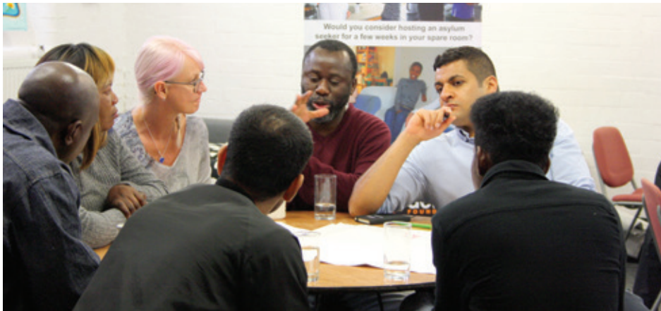
Residents discuss needs and ideas at the Residents Forum ▲

“ My situation before I moved to Action Foundation house was not good ... very, very hard. I was living in different houses every night, every week. I did not feel human. When I moved to the house I feel like I became a different person in the same day. You made a very, very big difference to my life. ”