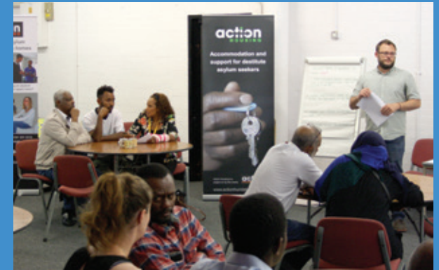
Residents Forum meeting at The CastleGate ▲

In December 2017 we secured a grant from The Nationwide Building Society to increase our capacity to provide support and training to our residents. This grant enabled us to recruit a Resident Support Trainer to work in partnership with Open Door North East who provide a similar housing service in Teesside. This new role assists the support workers at both organisations to develop and implement a range of training programmes to enable clients to overcome practical, cultural and other barriers in understanding how to successfully manage their occupancy and to assist clients in becoming more independent as they move to their own accommodation. Subjects covered include; managing money, bills, health and safety in the home, security, shopping, cooking, and cleaning as well as external factors that better help the individual navigate and integrate into life in the UK.